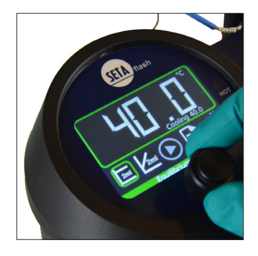
Select test temperature